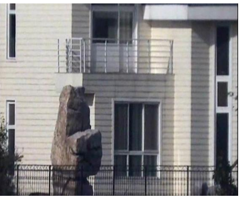
3KM Day Camera