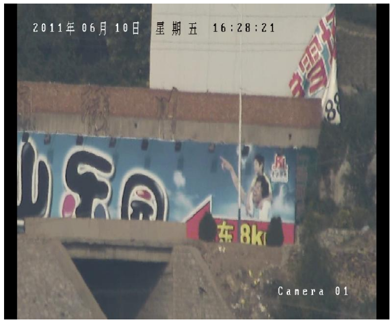
4.5KM Day Camera